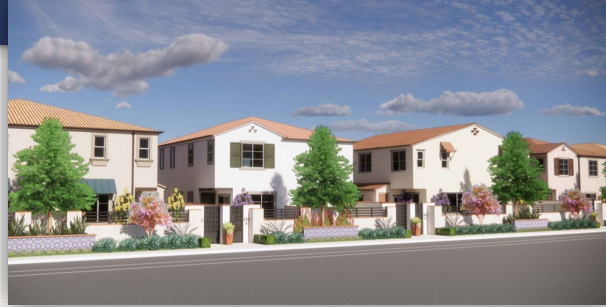
Independence at Natomas. Approved by City Council on 8/26/2025.