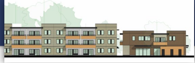
8740 Bruceville Road Apartments. Approved 1/30/2025.