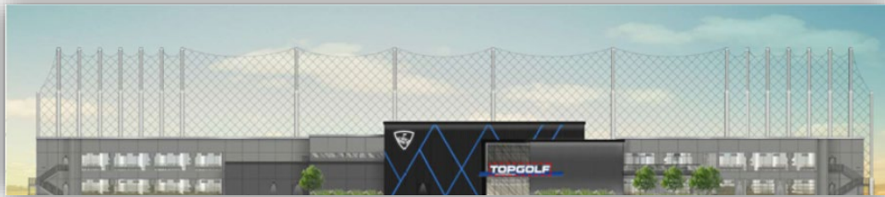
Natomas Top Golf, Venture Oaks Way. Approved 8/28/2025.