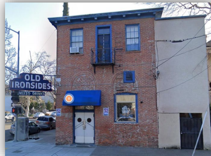
Old Ironsides, Alcohol CUP. Approved 8/14/2025.