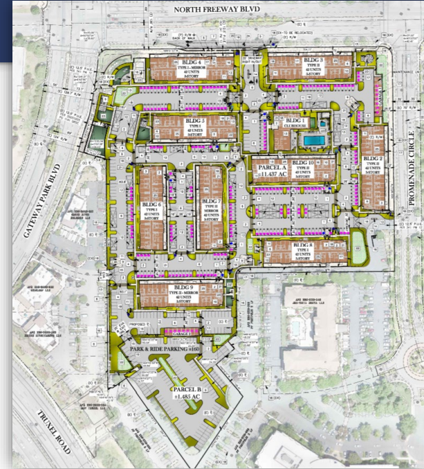
Birchway at Natomas Apartments. Approve by City Council on 8/26/2025.