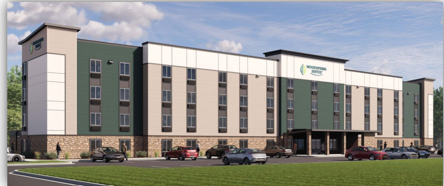
Woodspring Suites Hotel, 2270 Del Paso Rd, North Natomas. Approved by City Council on 3/25/2025.