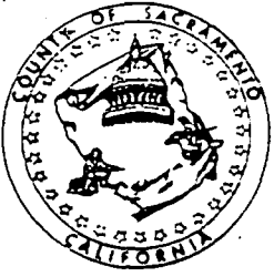
EXHIBIT B ET 27 SACRAMENTO COUNTY COMMISSION ON AGING

909 - 12th Street, Suite 200 Sacramento, California 95814 (916) 447-7063