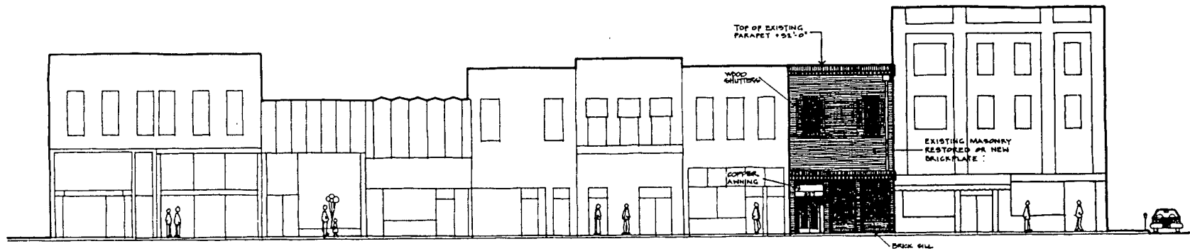
J STREET ELEVATION