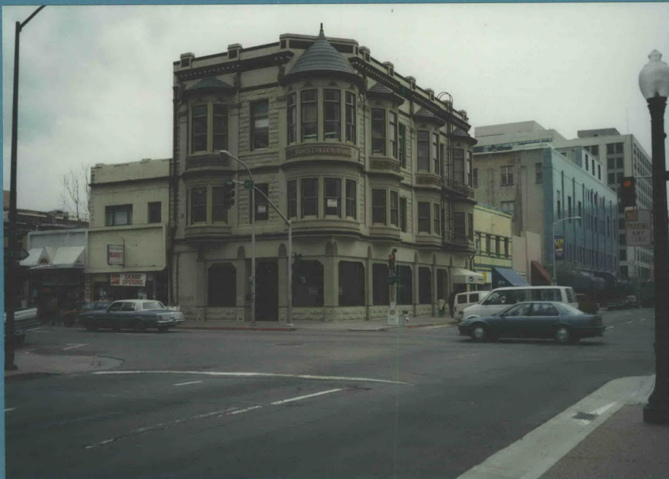
RUHSTALLER BUILDING: 900 J STREET, 9 th & J ST