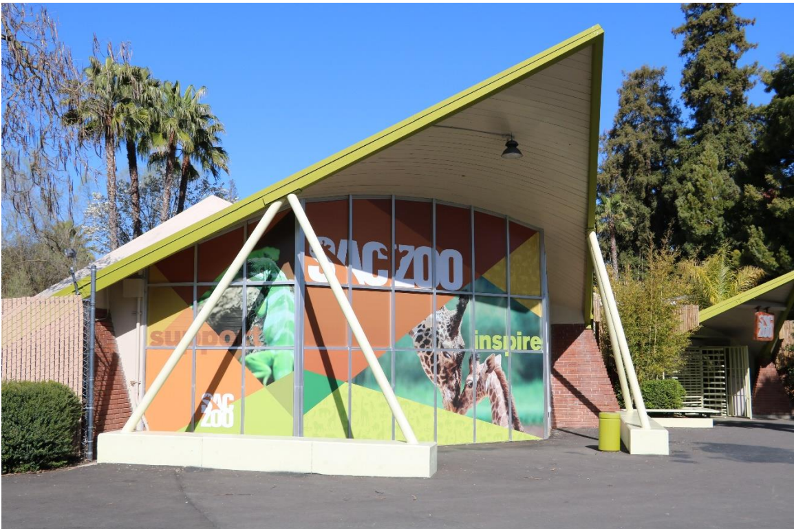
Photograph 2 of 7. Front (east) elevation of the southern component (Discovery Room) of the Sacramento Zoo Entrance, view facing northwest.