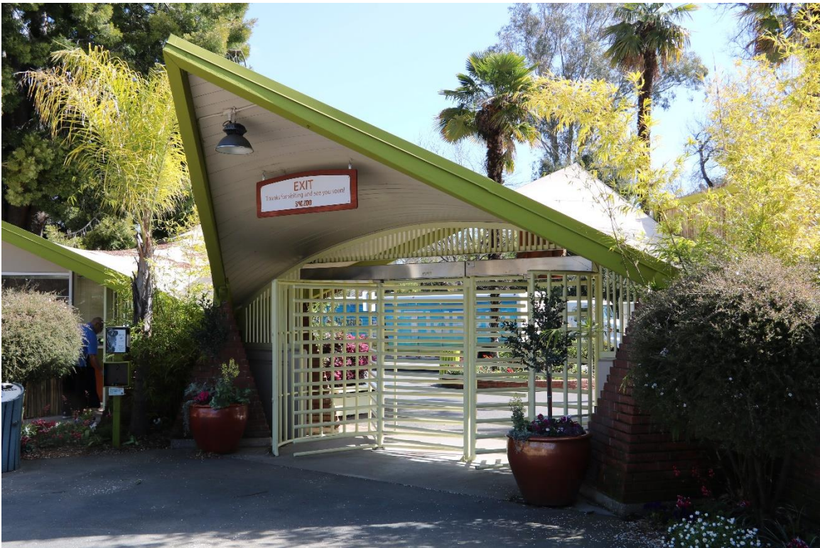
Photograph 6 of 7. Rear (west) elevation of the middle component of the Sacramento Zoo Entrance, view facing northeast.