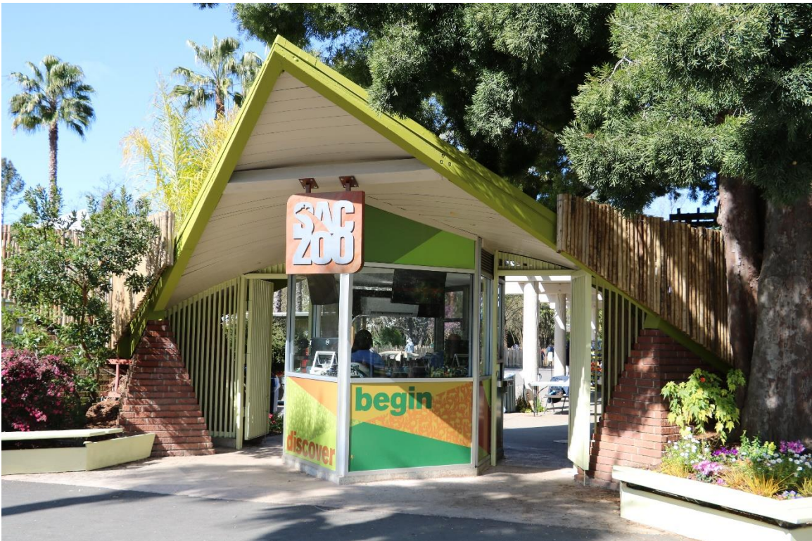
Photograph 4 of 7. Front (east) elevation of northern component of the Sacramento Zoo Entrance, view facing west.