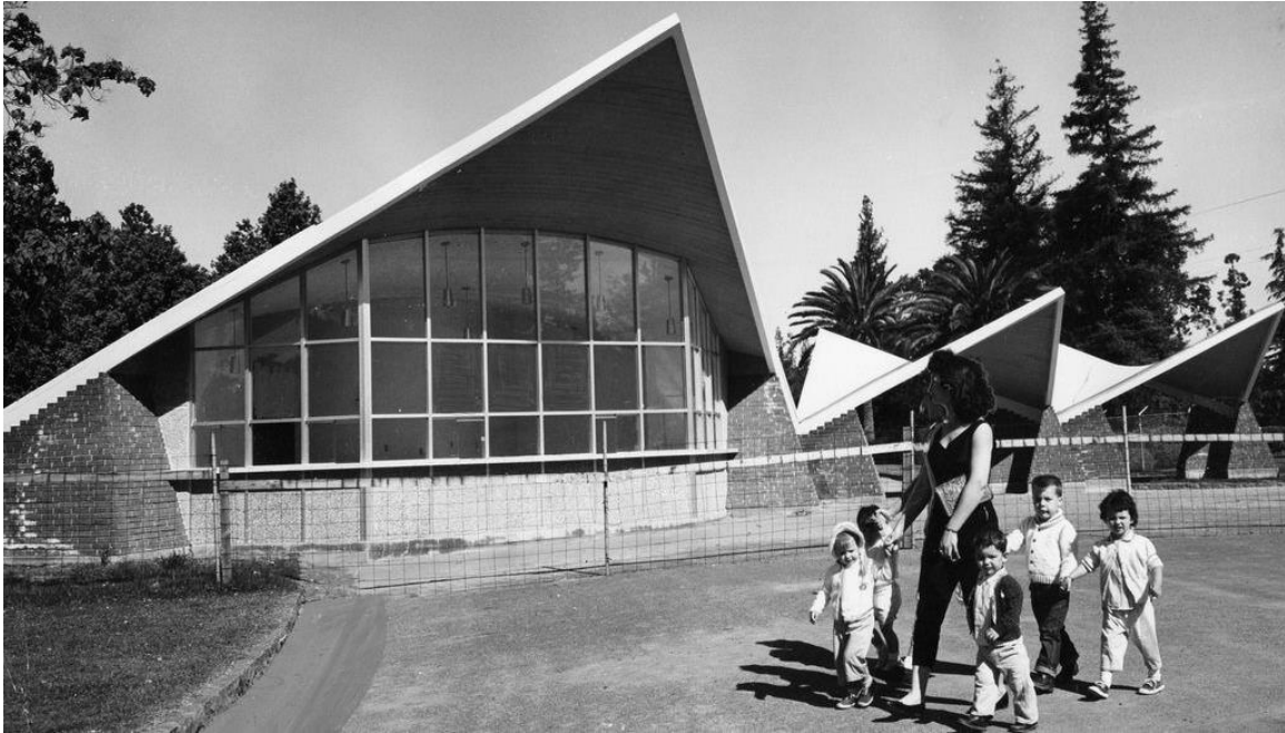
Figure 2. Sacramento Zoo Entrance while under construction, April 1961. 13