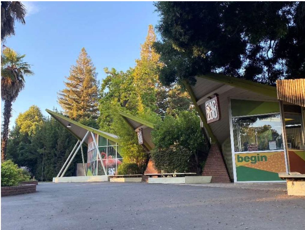
Figure 1: Zoo Entrance Structures Facing South

Rationale for Recommendation: Listing of Zoo Entrance Structures (3930 West Land Park Drive) (Figure 1) as a landmark on the Sacramento Register is consistent with the Historic Preservation Chapter (17.604) of the City Code and the goals of the 2035 General Plan. Listing the nominated resource on the Sacramento register will help ensure its preservation and encourage rehabilitation consistent with the U.S. Secretary of the Interior’s Standards for the Treatment of Historic Properties. The Zoo Entrance is a fine example of the Googie style developed out of Mid-century Modern architecture. This style has been called the Exaggerated Modern style due to its incorporation of the most dramatic features of Mid-century Modern architecture. This building meets criteria for listing in the Sacramento Register of Historic and Cultural Resources under City Code criteria 17.604.210(A) 1.a.iii, as the embodiment of distinctive characteristics of Googie architectural design of the mid-20th century; and for its association with master architects Rickey & Brooks making the property eligible under City Code 17.604.210 (A)1.a.iv.