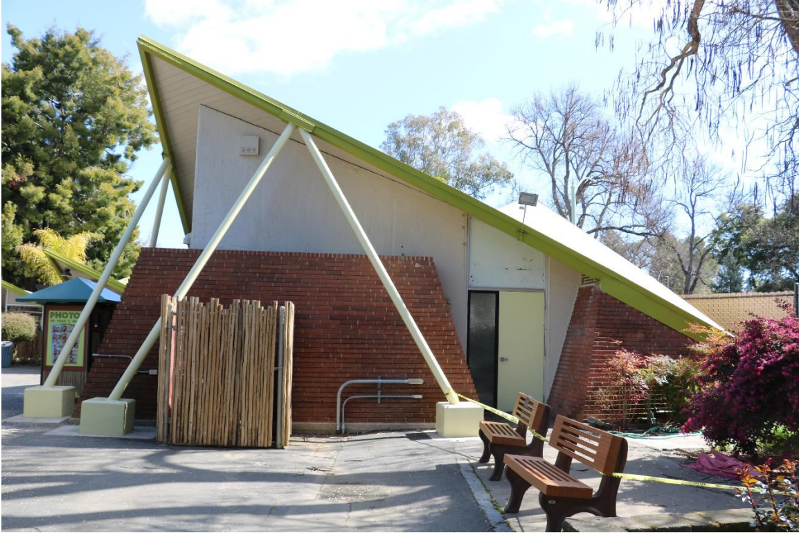
Photograph 5 of 7. Rear (southwest) elevation of the southern component (Discovery Room) of the Sacramento Zoo Entrance, view facing northeast.