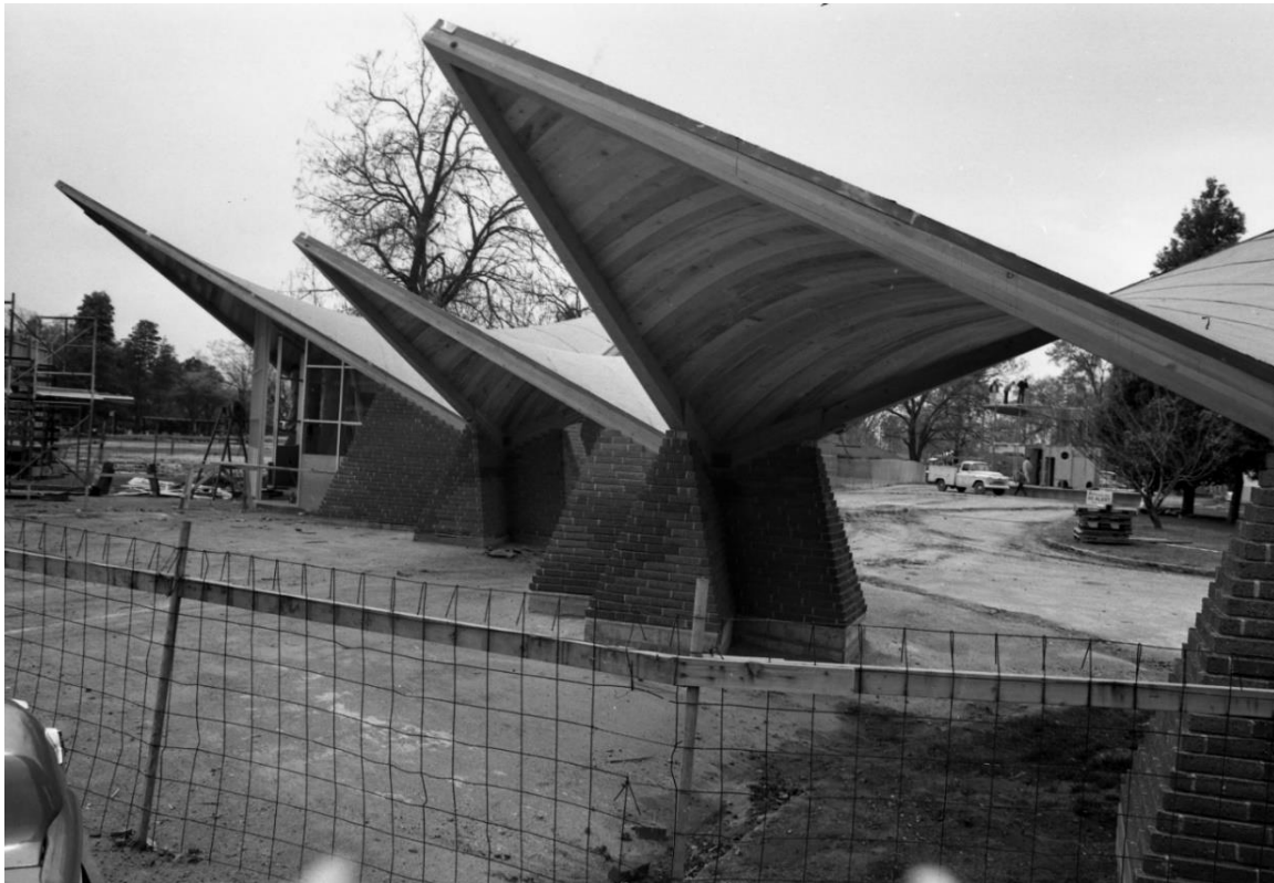
Figure 1. Sacramento Zoo Entrance while under construction, March 1961. 12

William Land Park Zoo Entrance Name of Property