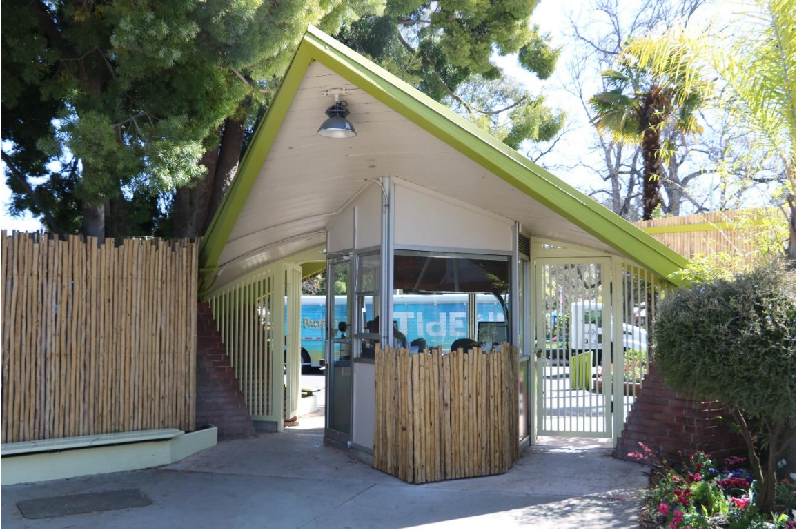
Photograph 7 of 7. Rear (west) elevation of the northern component of the Sacramento Zoo Entrance, view facing east.