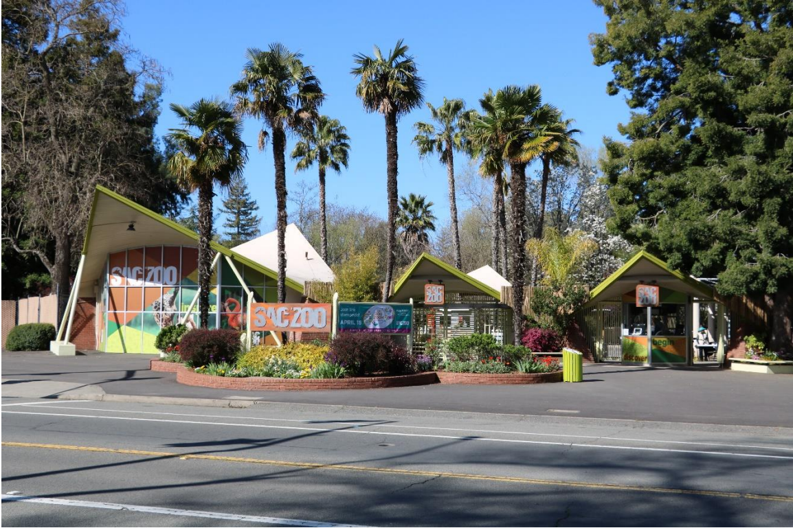
Photograph 1 of 7. Overview of front (east) elevation of Sacramento Zoo Entrance, view facing west.