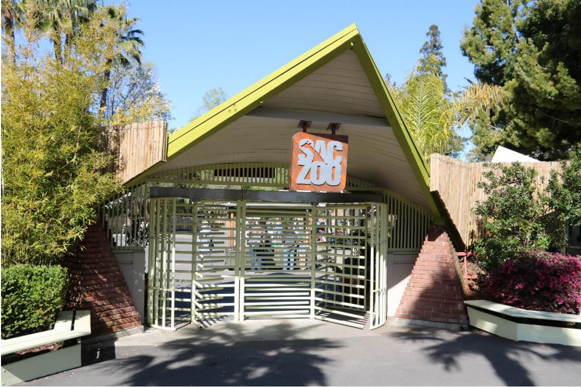
Photograph 3 of 7. Front (east) elevation of middle component of the Sacramento Zoo Entrance, view facing west.