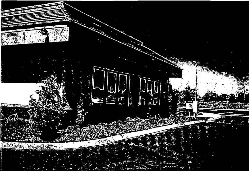
LEFT VIEW (SOUTH)