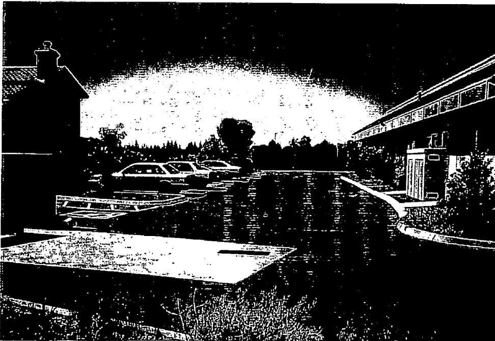
REAR VIEW (WEST)

RECEIVED APR 25 2000 CITY OF SACRAMENTO CITY PLANNING DIVISION