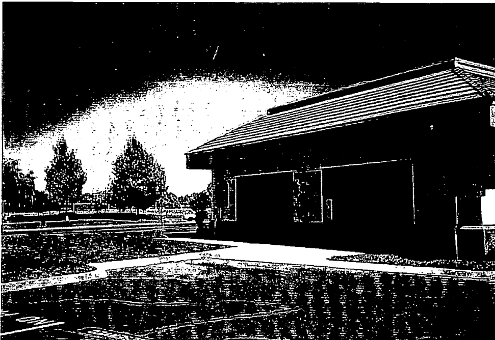
RIGHT VIEW (NORTH)

RECEIVED APR 25 2000 CITY OF SACRAMENTO CITY PLANNING DIVISION