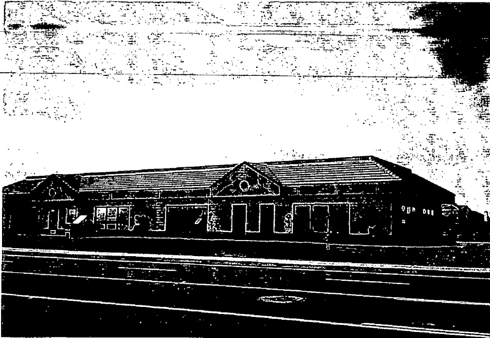
FRONT VIEW (EAST)