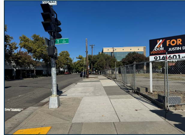
T Street After