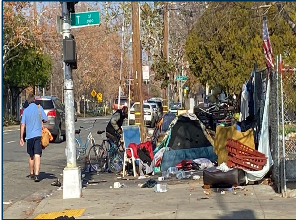
T Street Before