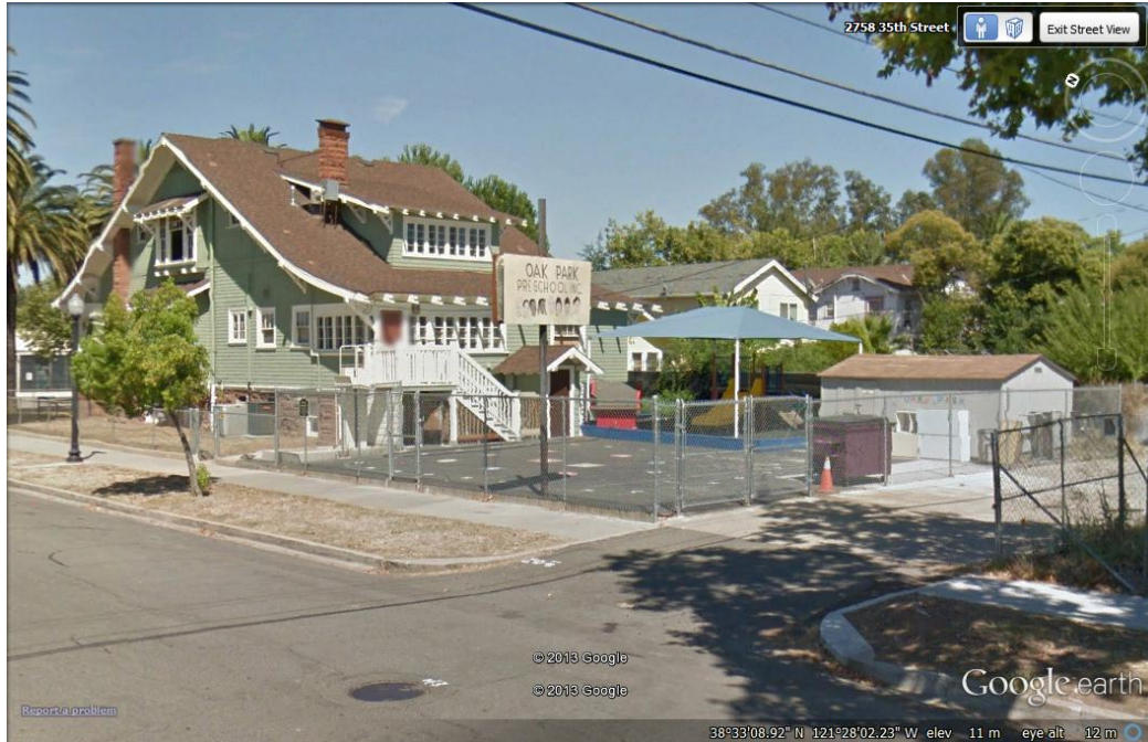
3500 2 nd Avenue, rear (south) elevation