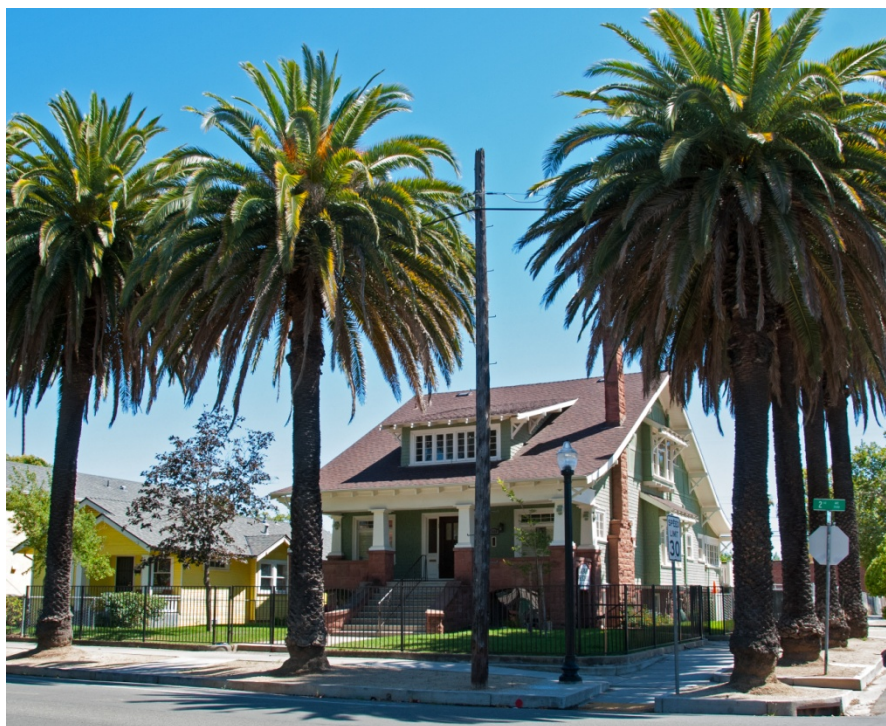
Setting—3500 2 nd Avenue, view to the southeast.