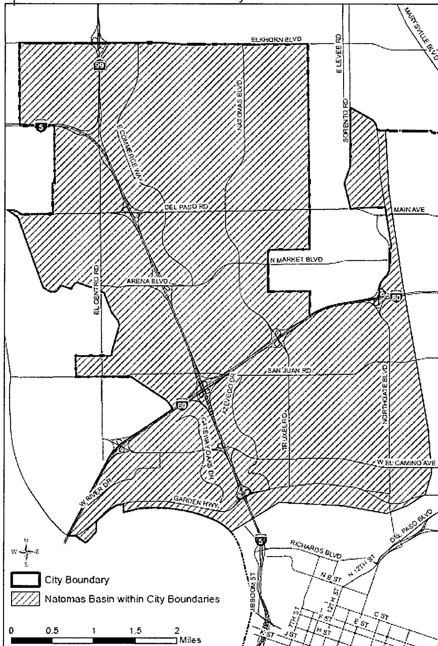
EXHIBIT A - Natomas Basin within City of Sacramento