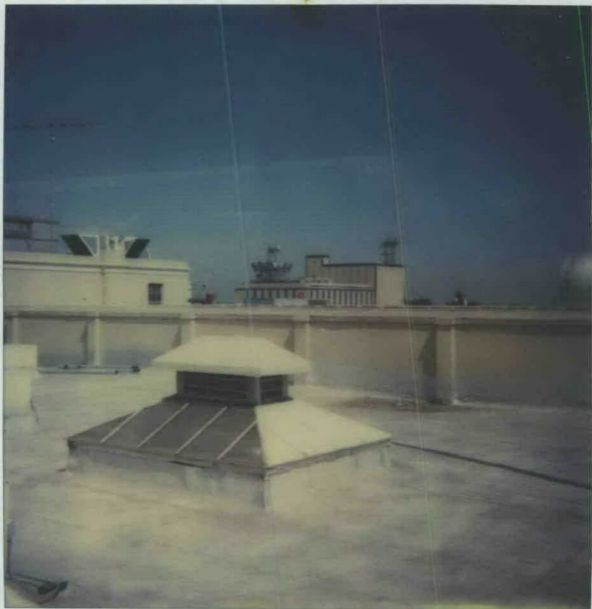
VIEW: NORTH EAST FROM ROOF