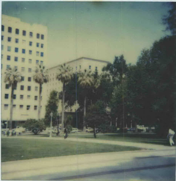
VIEW. NORTH FROM NORTH STEPS OF CAPITOL