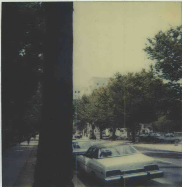
VIEW WEST FROM 12 TH E L