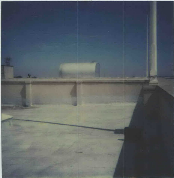
VIEW: EAST FROM ROOF